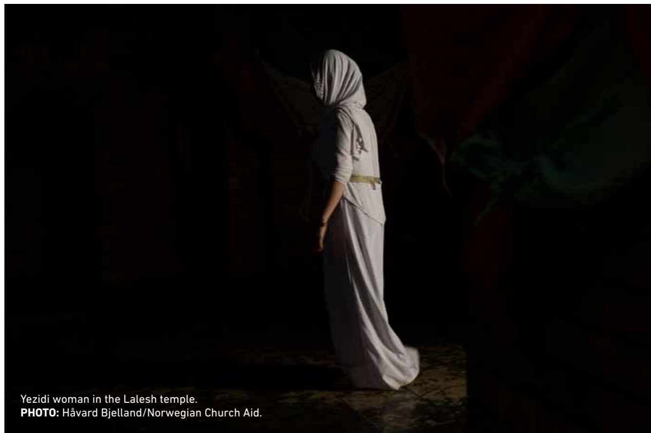
Yezidi woman in the Lalesh temple.