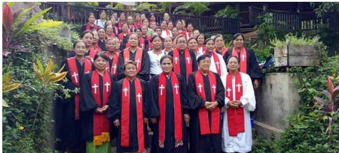
Ordained women ministries during the ordained women gathering.

Efforts must continue to be directed towards empowerment of ordained women ministers, to build their self-confidence and strengthen their influence; empowerment of un-ordained women, so women leadership in ministries is encouraged and women are given the capacities to take on such roles; and advocacy towards religious leadership, especially male leadership, to create more acceptance for women's leadership in religion.