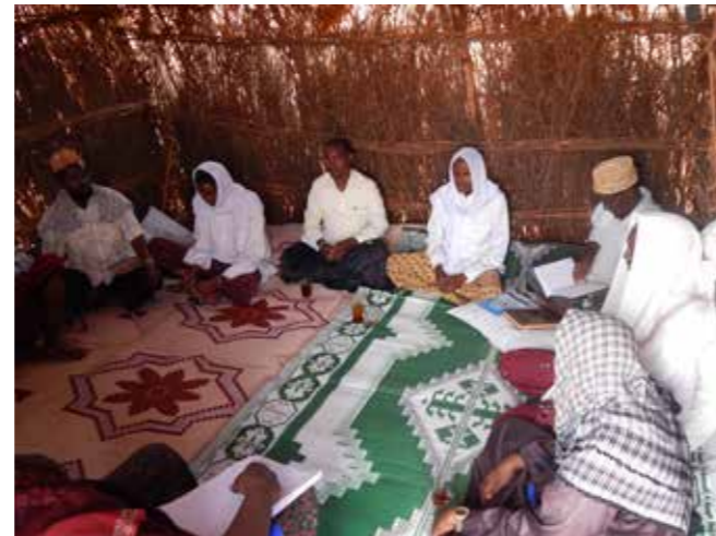
Religious leaders in a CC meeting in Garbaharrey district, Gedo region.

Collaboration with similar actors in Somalia such as the UN Joint programme (UNJP) and other organisations working in Somalia has been crucial. It provides an opportunity to network, share information and learn from each other's work. During the 1st phase of the project in 2014, the NCA/SC joint programme adopted the UNDP's campaign dubbed the "Saxarla campaign" that focuses on protection of the girl child from any form of harm, maintaining her as whole as she was created by God. The campaign messages were adopted by religious leaders and other change agents and continue to be used as advocacy talking points towards abandonment of all forms of FGM to date.