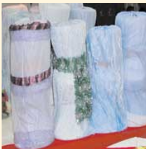
Several Xeeros full of Odkac and dates decorated for a wedding in Hargeisa, 3/04

In most cases in Northern Somalia, however, a midwife may be called to deinfibulate. This occurs once the "virginity" or artificial infibulation scar has been verified. It is believed that it saves husbands from the ordeal or damaging their sexual organs. Other parts of Somalia are replete with tales of men using sharp objects to break the artificial barrier.